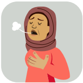
Short of breath