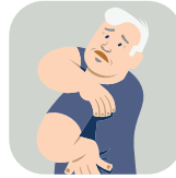
Shoulder/s or Back