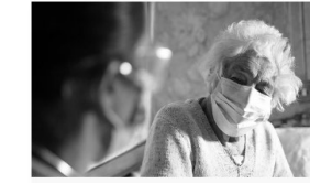
COVID-19, THE NEW CONSUMERISM, AND BUILDING TRUST