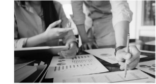
LISTENING FOR SIGNALS IN SURVEY DATA

Click the button to register your participation