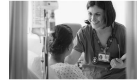
HOW TO BOUNCE BACK AFTER COVID-19'S SAFETY DECLINES