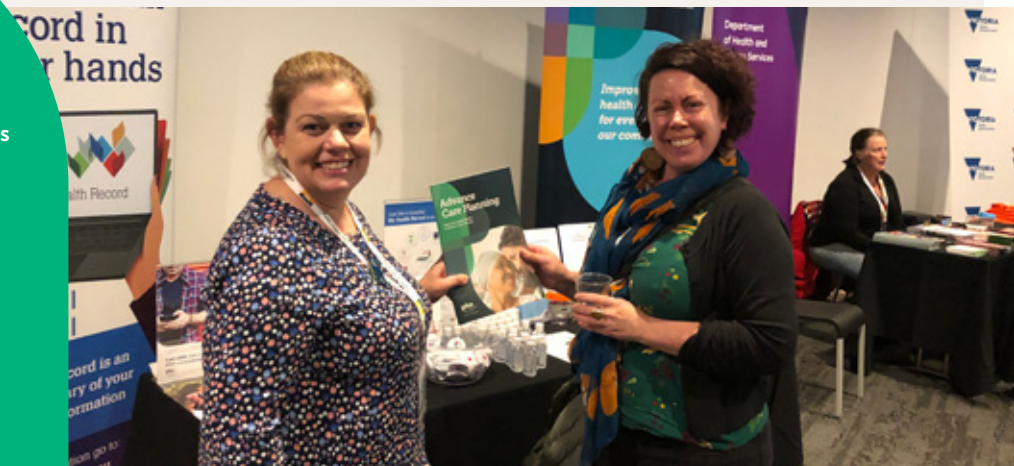
My Health Record and CAREinMIND resources were going hot from our stall at Prevention 2019.

The Public Health Association of Australia's Prevention 2019 Conference brought together stakeholders from all over our catchment in June. With this year's theme being 'Smashing the Silos', this conference focused on exploring economics and prevention, what is working and what needs to be strengthened to close the gaps in prevention systems. NWMPHN staff were kept busy at our stall, handing out flyers promoting My Health Records and our CAREinMIND services.