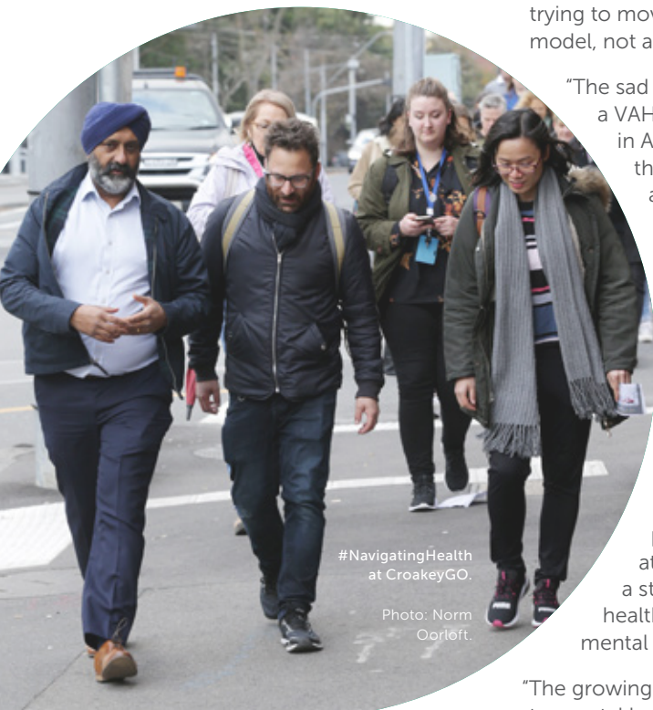
#NavigatingHealth at CroakeyGO.