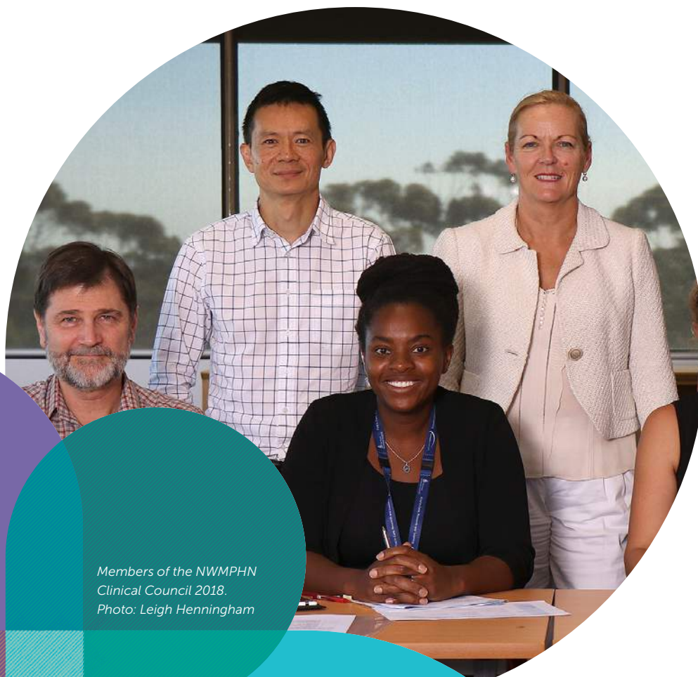
Members of the NWMPHN Clinical Council 2018.

The attached notes form part of these financial statements.