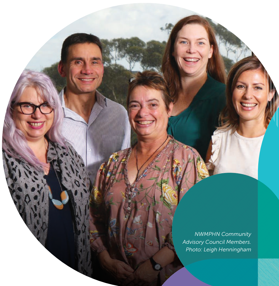
NWMPHN Community Advisory Council Members.

B – Number of meetings held during the time the director held office during the year