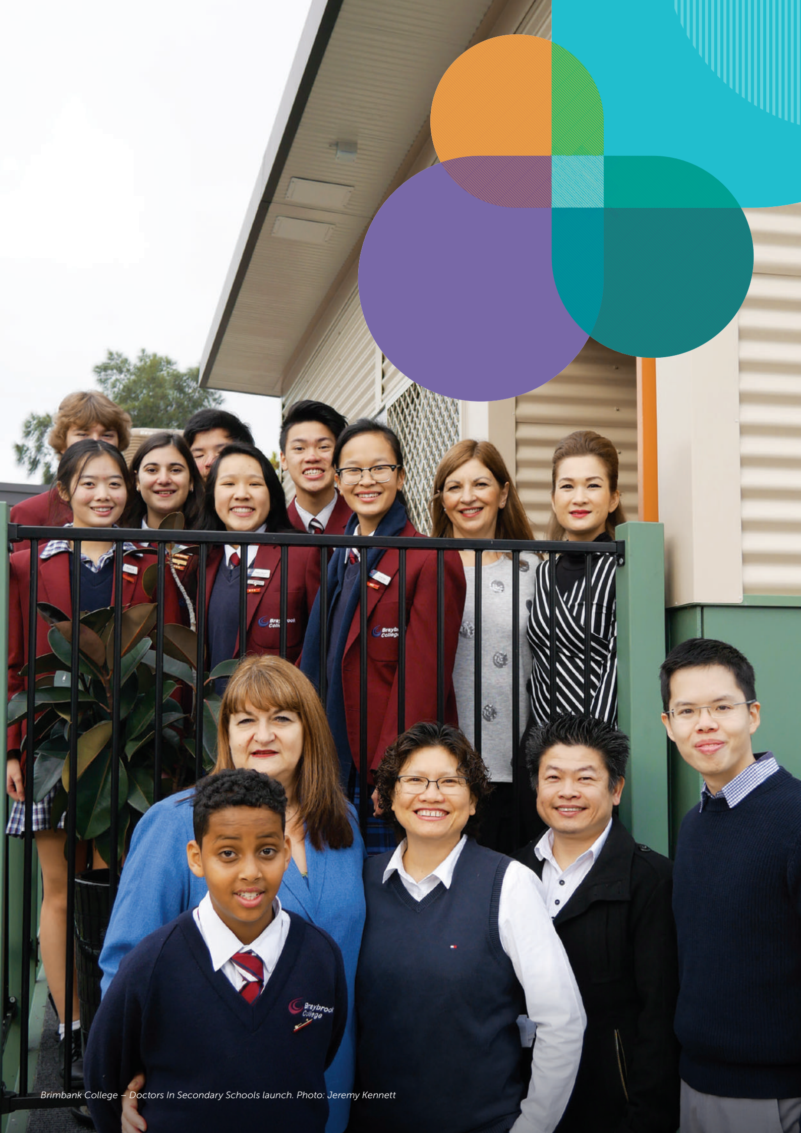
Brimbank College – Doctors In Secondary Schools launch.